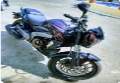
Bajaj Dominar 400 2017