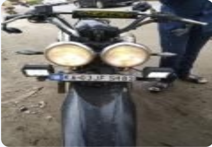
Mahindra Mojo 300cc 2016