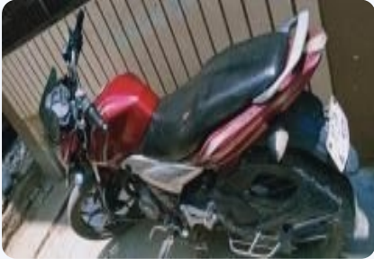
Bajaj Discover 125ST 2012