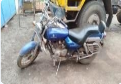
Bajaj Avenger 220cc 2014