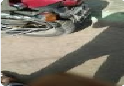
Bajaj Avenger 220cc 2012