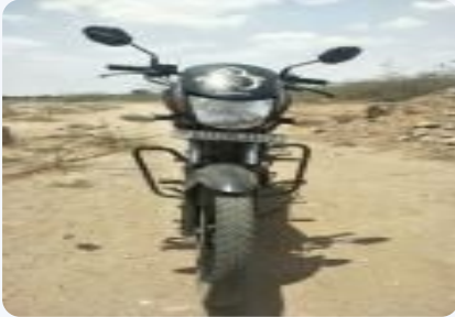
Honda CB Shine 125cc 2011