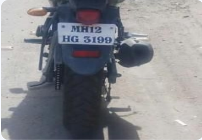
Yamaha FZ16 150cc 2011