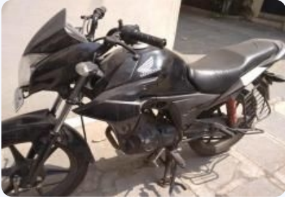
Honda CB Twister 110cc 2010