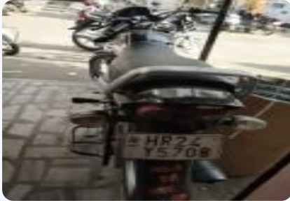
Hero HF Deluxe 100cc 2017