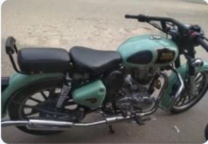
Royal Enfield Classic 350cc 2016