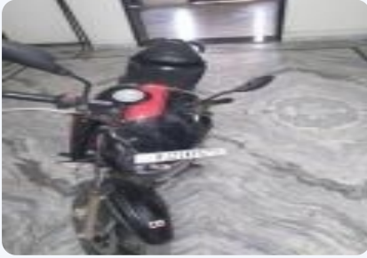
TVS Apache RTR 200 4V Carburetor Pirelli Tyres Race Edition 2.0 2018