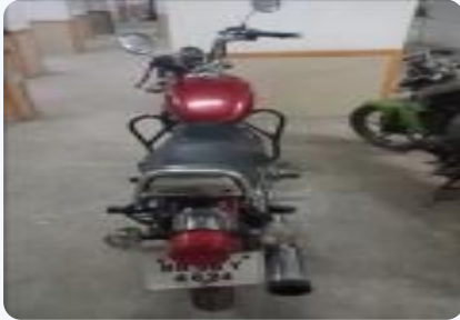
Royal Enfield Thunderbird 350cc 2012