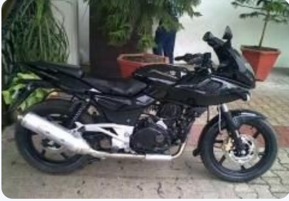
Bajaj Pulsar 220F 2016