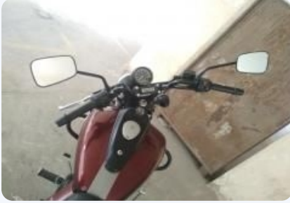
Bajaj Avenger Street 150 2016