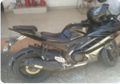
Yamaha YZF-R15 2.0 150cc 2013