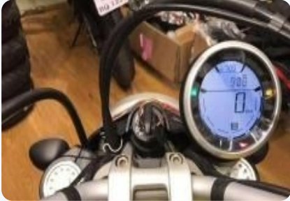
Ducati Scrambler Icon 2017