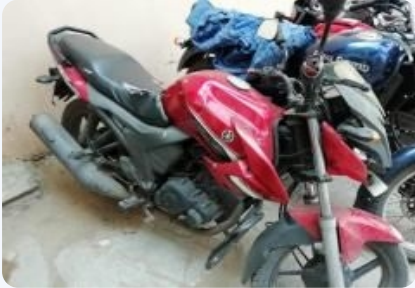
Yamaha SZX 150cc 2011