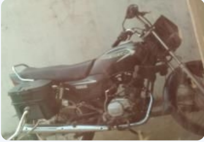
Yamaha Crux 110cc 2004