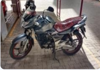
Suzuki GS 150 R 150cc 2009