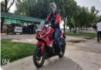
Bajaj Pulsar RS200 ABS 2016