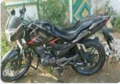
Hero Xtreme 150cc 2014