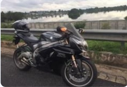
Suzuki GSX-R 1000cc 2012