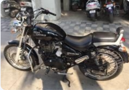
Royal Enfield Thunderbird 350cc 2013