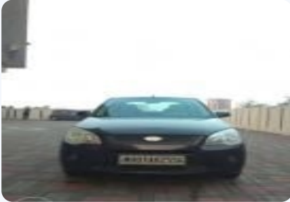
Ford Fiesta EXI 1.4 TDCI 2008