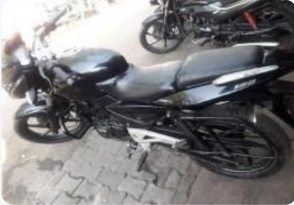
Bajaj Pulsar 180cc 2010