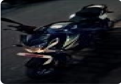
Bajaj Pulsar 200 NS 200cc 2015