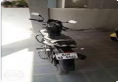
Bajaj Pulsar 150cc 2009