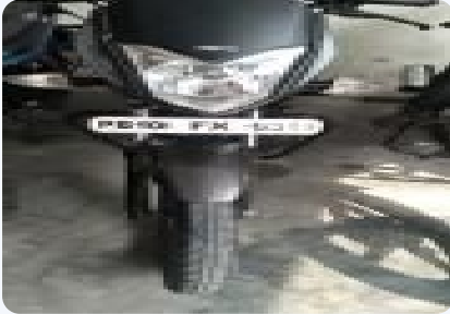
Hero Splendor iSmart 110cc 2016