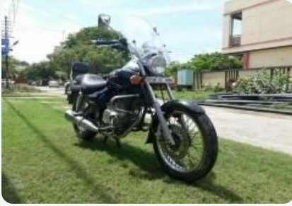
Bajaj Avenger 220cc 2010