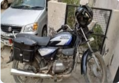
Hero Splendor Plus 100cc 2006