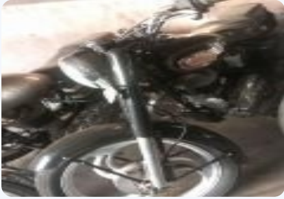
Royal Enfield Bullet 350cc 2000