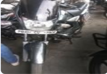
Bajaj Platina 100cc 2010