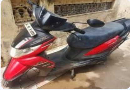
Yamaha Ray ZR 110cc 2013