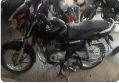
Bajaj Discover 125cc 2005