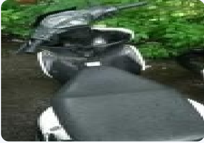
Yamaha Ray-Z 110cc 2015