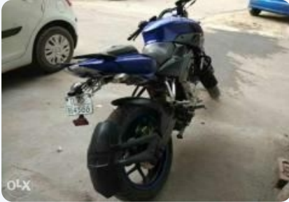
Bajaj Pulsar NS 200 2011