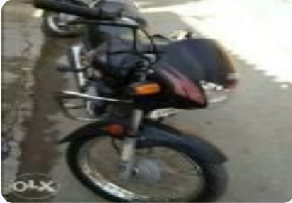
Hero Passion Plus 100cc 2005