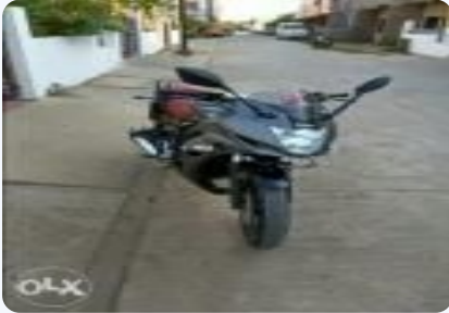
Suzuki Gixxer SF 150cc Special MotoGP Edition Rear Disc 2017