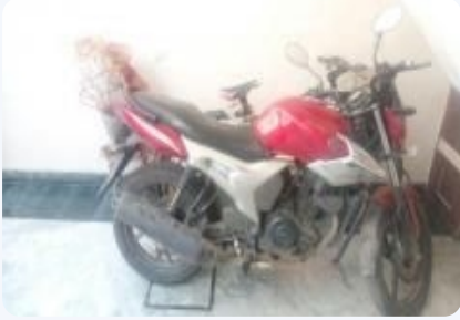
Yamaha SZR 150cc 2011