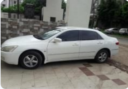
Honda Accord 2.4 VTi-L MT 2006