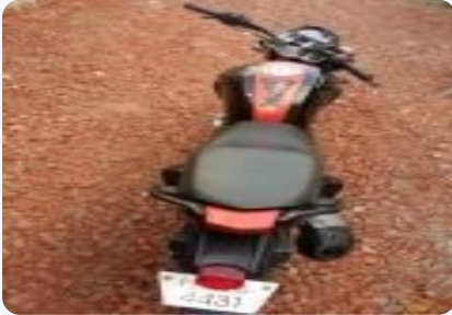
Yamaha FZs 150cc 2013