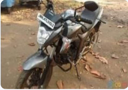
Suzuki Gixxer 150cc 2016