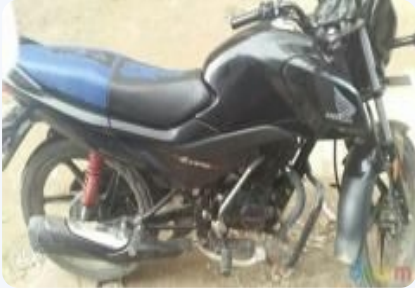
Honda Livo 110 110cc 2015