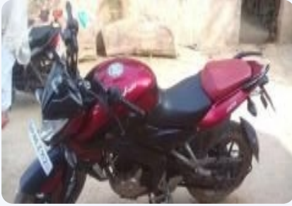
Bajaj Pulsar 150cc 2013