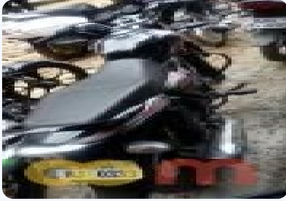
Bajaj Discover 100cc 2011