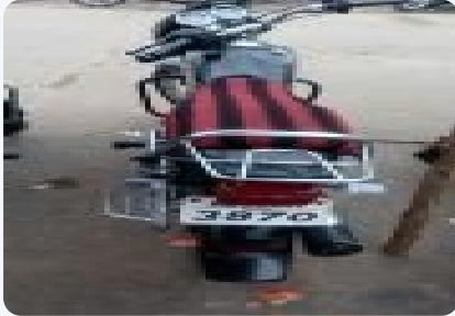
Hero Splendor Pro 100 cc 2010