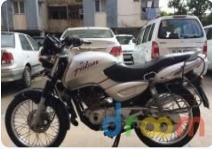
Bajaj Pulsar 150cc 2005