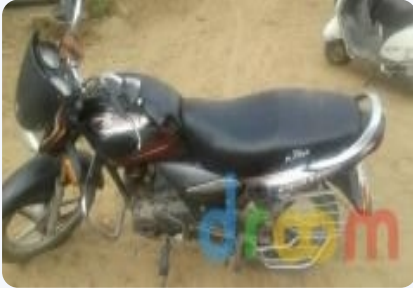
Bajaj Platina 100cc 2008