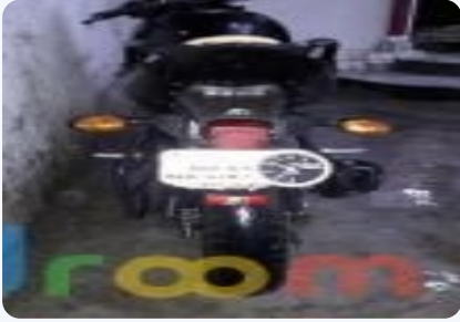
Yamaha FZs 150cc 2010