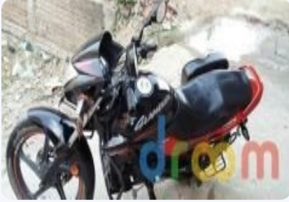
Hero Glamour 125cc 2015